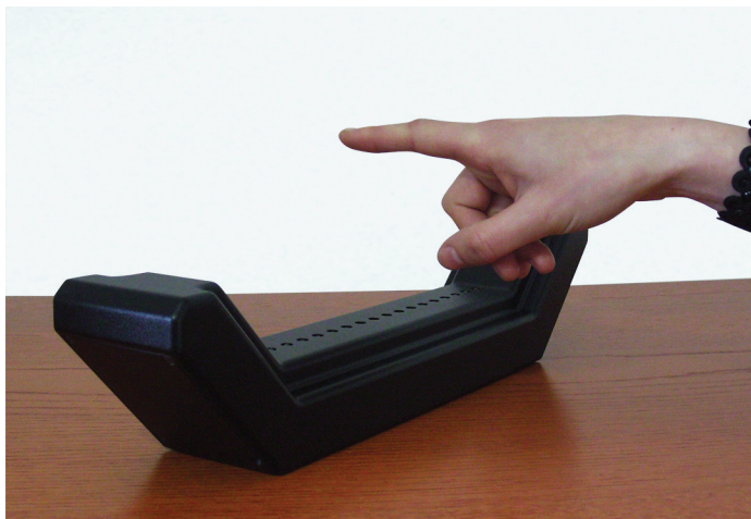
The AirTrack System is hand tracking technology at its finest.