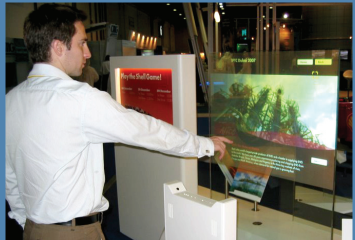
Custom AirTrack display for energy and petrochemical giant Shell.

The AirTrack System comes pre-configured for plug and play usability and it's specially designed to withstand harsh lighting conditions. For unique installations, GestureTek can also create custom designs.