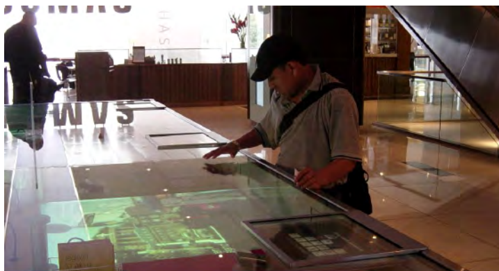
Stunning interactive orientation table lets users' fingers do the walking

Visitors to the Eureka Tower in Melbourne, Australia experience GestureTek's state-of-the-art 'Serendipity Table'. At 18' x 5' it's the world's largest multi-touch table. With a wave of their hand, users can open up stories that recount the history of the city.