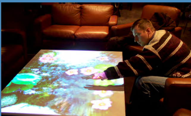
Illuminate Table engages and entertains restaurant patrons.

Choose our standard 32" high table with a 50" gesture-controlled tabletop screen or request custom services to deliver multi-touch surface designs of all shapes and sizes.