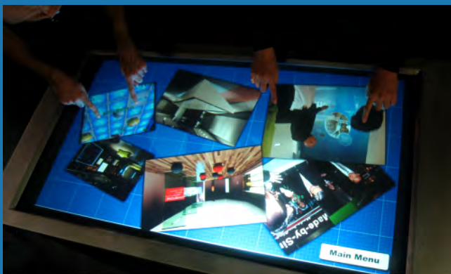
GestureTek's standard turnkey Illuminate Multi-Touch Table

GestureTek's surface computing solutions can transform any ordinary surface - like a table, bar top or wall - into a natural interface to dynamic content in the virtual world. Access, control and interact with vibrant computer content, using two hands to manipulate data in unique ways. Use natural hand gestures to engage dazzling graphics and special effects. Resize, reshape, rotate and zoom in and out of images on the fly. Or access the Internet in a truly compelling way. For years, GestureTek has been delivering these types of interactive surface solutions to nightclubs, hotels, stores and sales centers - and their customers are loving it!